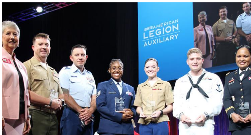
2023 ALA Salute to Servicemembers Award Winners

Salute to Servicemembers Award (legion-aux.org)